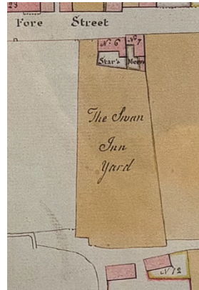
Figure 1 - 1770 map showing the Swan Inn