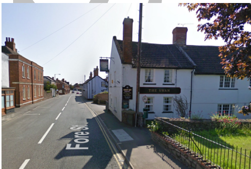
Figure 4 - The Swan Inn on Fore Street

The Swan Inn is an important historic building that reflects the development of trade, travel, and hospitality in North Petherton over several centuries. Its survival within the historic streetscape provides valuable evidence of the town's commercial past.