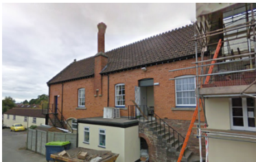
Figure 2 - Assembly Room, visible today - From Google Street Maps

The inn continued in use into the 20 th century until it closed before 2012.