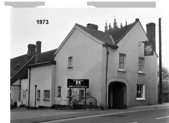
Figure 3 - The Swan Inn c. 1973.

From Medieval Alehouse to Modern Building